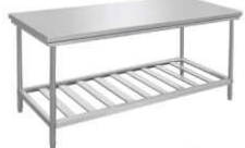
Work Table With Under Shelf