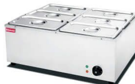
Electric Bain Marie

Model: HB-1080 Dimension: 1080x750x280mm Volts: 220-240V/50-60Hz Power: 3KW Weight: 28.2Kg