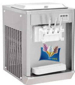
Ice Cream Machine

Model: HIM-01 Dimension: 570x740x750mm Volts: 220-240V/50-60Hz Power: 0.9KW Output: 8-11Kg/Hour(13-18L) Refrigerant: R22/R404A N/W: 59Kg