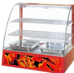
Food Display Warmer

Model: HW-2P Dimension: 660x480x630mm Volts: 220~240V/50~60Hz Power: 0.8KW N/W: 21Kg