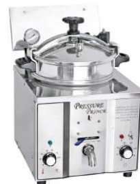
Electric Pressure Fryer

Model: MDXZ-16 Dimensions: 350x400x500mm Packing Size: 430x500x540mm Capacity: 16L Volts: 220V/50Hz Power: 3KW N/W: 18Kg For 2-3 Chickens