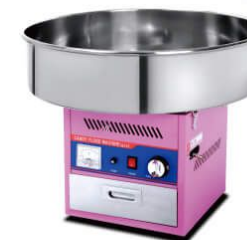
Gas Candy Floss Machine

Model: HGC-03 Dimension: 460x460x501mm Volts: 220-240V/50-60Hz Power: 1KW/Hour + 0.03KW