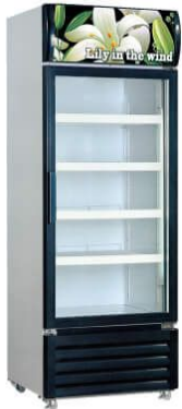
BC-418 BC-468 BC-518 BC-628 Beverage Cooler