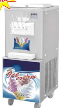
Ice Cream Machine

Model: HIM-02 Dimension: 700x900x1435mm Volts: 220-240V/50-60Hz Power: 1.7KW Output: 11-16Kg/Hour(18-25L) Refrigerant: R22/R404A N/W: 135Kg