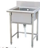
Single Sink Bench