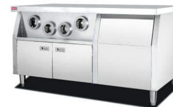
Cup Dispenser with Ice Storage

Model: HCS-02-A Dimension: 1200x760x790mm Volts: 220-240V/50-60Hz Power: 0.65KW N/W: 50Kg