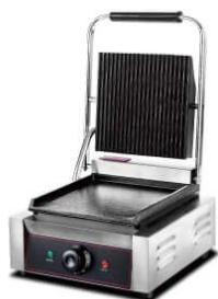
Electric Contact Grill

Model: HET-815A(All Grooved) Dimension: 450x360x220mm Volts: 220V/50Hz Power: 2.5KW N/W: 19Kg