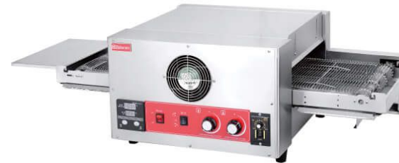
Electric Conveyor Pizza Oven

Model: HEP-2ST Temperature: 0-350°C Pizza Stone Size: 400x400mmx2pcs Machine Size: 560x570x440mm Packing Size: 610x570x480mm Volts: 220-240V/50-60Hz Power: 3KW N/W: 33Kg