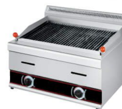
Gas/Electric Lava Rock Grill

Model: HGL-84 Dimension: 620x770x460mm Gas: LPG or Natural Gas Heating: 16KW/Hour