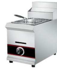
1-Tank 1-Basket Gas Fryer

Model: HGF-71 Dimension: 300x600x550mm Capacity: 8L Power: 4KW/Hour N/W: 22Kg