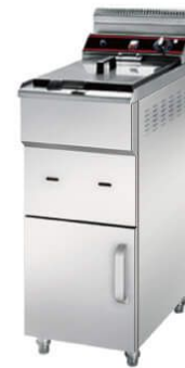
1-Tank 1-Basket Gas Fryer

Model: HGF-181C Dimension: 345x585x1025mm Capacity: 18L Gas: LPG or Natural Gas N/W: 25Kg