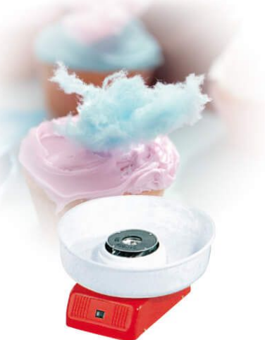
Electric Candy Floss Machine

Model: HGC-04 Dimension: 730x730x500mm Volts: 220-240V/50-60Hz Power: 1KW/Hour + 0.03KW