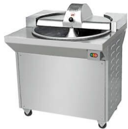
Food Cut Up Machine

Model: TQ-8/TQ-8A (Painting/ SS body) Size: 800x550x550mm Volts: 220V/50Hz Power: 0.75KW Productivity: 120Kg/Hour Weight: 90Kg