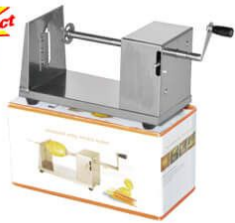
Tornado Potato Cutter

Model: HSP-01 Dimension: 450x150x180mm N/W: 2.5Kg