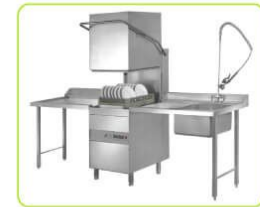
Hook Type Dish Washer

Model: HYT-C88 Dimension: 700x640x1430mm Volts: 380V /50Hz Total Power: 13KW Average Hourly Capacity: 60Basket/Hour High Temperature Tank Capacity: 7L Wash Tank Capacity: 30L High Temperature Tank Power: 9KW Wash Tank Power: 3KW