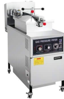
Gas Pressure Fryer

Model: MDXZ-25 Dimension: 460x960x1230mm Packing Size: 1030x510x1300mm Capacity: 25L Volts: 220V/50Hz Gas: LPG or Natural Gas Working Pressure: 0.085Mpa N/W: 110Kg