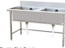
Double Sink Bench