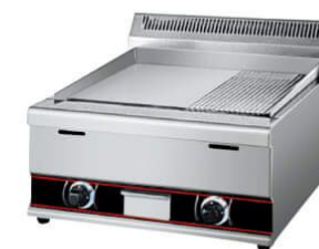
Gas Griddle (1/3 Grooved)

Model: HGG-750-2 Dimension: 750x600x475mm Gas: LPG or Natural Gas Power: 11.7KW