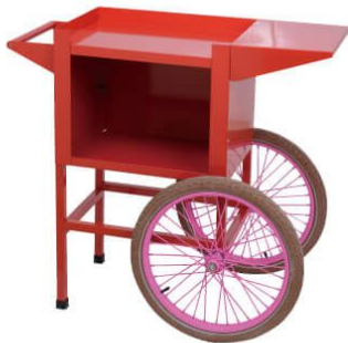
Popcorn Machine Cart

Model: HP-DC Dimension: 910x490x1630mm Volts: 220-240V/50-60Hz Power: 1.5KW N/W: 38Kg