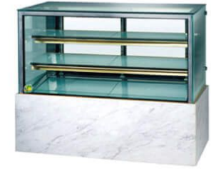
G510FS G710FS G910FS Cake Showcase