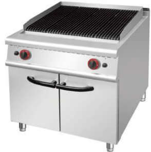
Gas Lava Rock Grill with Cabinet

A Model: HGL-907 Dimension: 800x900x920mm Packing Size: 880x980x1040mm Power: 58188BTU/Hour N/W: 137Kg A Model: HGL-707 Dimension: 700x750x920mm Packing Size: 780x830x1040mm Power: 49288BTU/Hour N/W: 113Kg