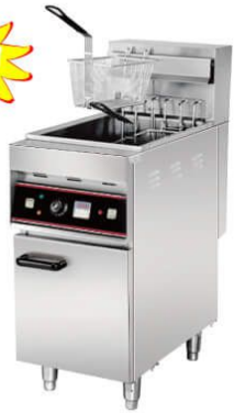
1-Tank 2-Basket Electric Fryer

Model: HEF-26 Dimension: 420x830x1080mm Capacity: 30L Volts: 380V Power: 10KW N/W: 38Kg