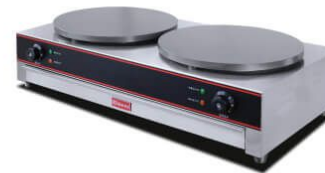
2-Plate Electric Crepe Maker

Model: HCM-2 Dimension: 860x470x230mm Volts: 220V/50Hz Power: 6KW N/W: 44Kg