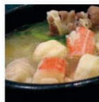
Counter Top Gas Bain Marie

Model: HGL-609 Dimension: 700x680x480mm Hp: 27.7MJ Valve Type: Low-pressure Valve Butners: 1 N/W: 29Kg