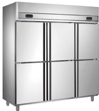
Commercial Kitchen Freezer

Model: HKF-1810 Dimension: 1810x730x1920MM Volts: 220V Power: 580W Temperature: -12-12°C