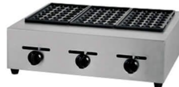
Gas 3-Head Fish Grill

Model: HX-65 Dimension: 740x470x260mm Volts: 220V/50Hz Power: 6KW N/W: 42Kg