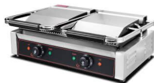
Electric Contact Grill

Model: HEG-813A (Down Flat) Dimension: 580x400x210mm Volts: 220V/50Hz Power: 1.8+1.8KW N/W: 26Kg