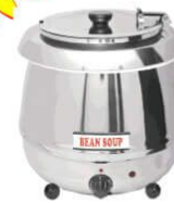
Stainless Steel Electric Soup Kettle

Model: 81010SP Dimension: 10L Volts: 220V AC 50Hz Power: 400W