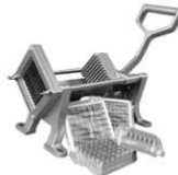
Vegetable & Fruit Cutter

Model: HWM-550 Dimension: 550x660x155mm Volts: 220V/50HZ Power: 0.21KW N/W: 7Kg