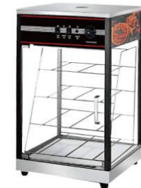
Pizza Display Warmer

Model: HW-816 Dimension: 490x490x810mm Volts: 220-240V/50-60Hz Power: 0.65KW Weight: 15Kg