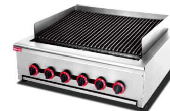
Gas Char Grill

Model: HEL-841 Dimension: 760x650x550mm Volts: 220V/50Hz Power: 9KW