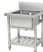
Single Sink Bench