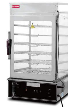
Food Display Warmer

Model: HW-600H Dimension: 480x540x840mm Volts: 220~240V/50~60Hz Power: 1.6KW N/W: 36Kg