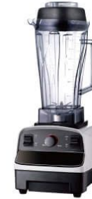
CB-787 Commercial Blender