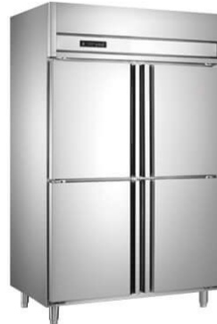
Commercial Kitchen Freezer

Model: HKF-610 Dimension: 610x730x1920MM Volts: 220V Power: 230W Temperature: -12-12°C