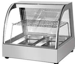
Curved Warming Showcase

Model: HW-838 Dimension: 730x770x730mm Volts: 220-240V/50-60Hz Power: 0.85KW