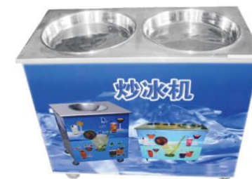
Fried Ice Cream Machine

Model: FIM-A22 Dimension: 830x440x700mm Volts: 220V/50Hz Power: 1.8KW Output: 25Kg/hour N/W: 60Kg