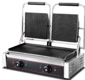
Electric Contact Grill

Model: HEG-811 Dimension: 305x400x210mm Volts: 220V/50Hz Power: 1.8KW N/W: 14Kg