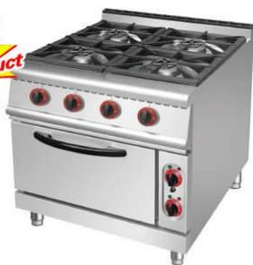
4-Burner Gas Range with Oven

A Model: HGR-905 Dimension: 800x900x920mm Packing Size: 880x980x1040mm Inner Oven Size: 560x700x270mm Power: 64348BTU/Hour N/W: 156Kg A Model: HGR-705 Dimension: 700x750x920mm Packing Size: 780x830x1040mm Inner Oven Size: 560x700x270mm Power: 64348BTU/Hour N/W: 117Kg