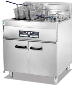
2-Tank 4-Basket Computer Fryer

Model: HEF-872 Dimension: 800x800x1125mm Capacity: 28L+28L Volts: 3N~380V Hp: 18+18KW N/W: 80Kg