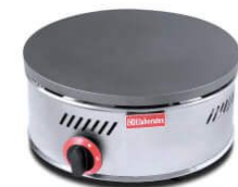
1-Plate Gas Crepe Maker

Model: HCM-400 Dimension: 400x400x190mm Volts: 220V/50Hz Power: 2.2KW N/W: 20Kg