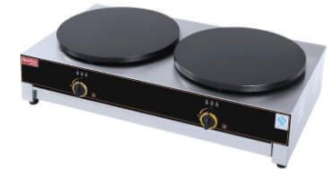
2-Plate Gas Crepe Maker

Model: HCM-2 Dimension: 860x470x230mm Volts: 220V/50Hz Power: 6KW N/W: 44Kg