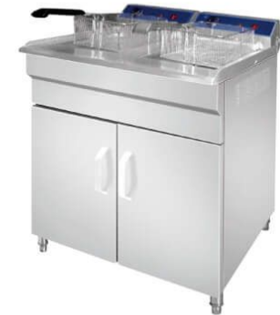
2-Tank 2-Basket Electric Fryer

Model: HEF-162C Dimension: 690x530x940mm Capacity: 16Lx2 Volts: 220-240V Power: 5KWx2 N/W: 33.5Kg