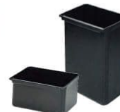
Plastic Tote Box