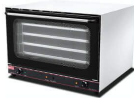
Electric Convection Oven

Model: HEB-4F Dimension: 595x600x580mm Volts: 220V/50Hz Power: 2.6KW N/W: 39Kg