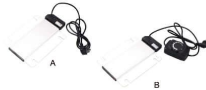
Electric Heat board

Model: 301129 Machine Size: 600x350x320MM Packing Size: 610x360x240MM