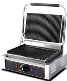
Electric Contact Grill

Model: HEG-811 Dimension: 305x400x210mm Volts: 220V/50Hz Power: 1.8KW N/W: 14Kg