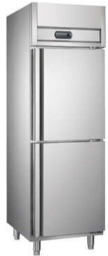
Commercial Kitchen Freezer

Model: HKF-610 Dimension: 610x730x1920MM Volts: 220V Power: 230W Temperature: -12-12°C