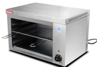
Electric Hanging Salamander

Model: HGL-82 Dimension: 360x770x460mm Gas: LPG or Natural Gas Heating: 8KW/Hour