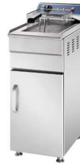
1-Tank 1-Basket Electric Fryer

Model: HEF-161C Dimension: 340x530x940mm Capacity: 16L Volts: 220-240V Power: 5KW N/W: 20.6Kg