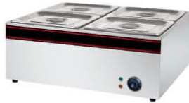
Electric Bain Marie

Model: HB-750 Dimension: 750x750x280mm Volts: 220-240V/50-60Hz Power: 3KW N/W: 18Kg