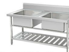
Binary Wash Dish Even Things