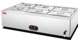
Electric Bain Marie

Model: HB-6T Dimension: 1100x680x290mm Volts: 220-240V/50-60Hz Power: 1.6KW N/W: 27Kg