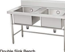
Double Sink Bench