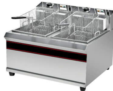
2-Tank 2-Basket Electric Fryer

Model: HEF-904 Dimension: 660x600x440mm Packing Size: 720x670x545mm Capacity: 25L Volts: 220V-240V/50-60Hz Power: 4.5+4.5KW N/W: 23.2Kg