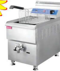
1-Tank 1-Basket Gas/Electric Fryer

Model: HGF-779 Dimension: 340x615x630mm Capacity: 18L Gas: LPG Power: 5KW/Hr N/W: 22Kg