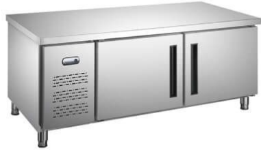
Freezer Work Table

Model: HWT-1500 Dimension: 1500x600x800MM Volts: 220V Power: 180W Temperature: -6-6°C