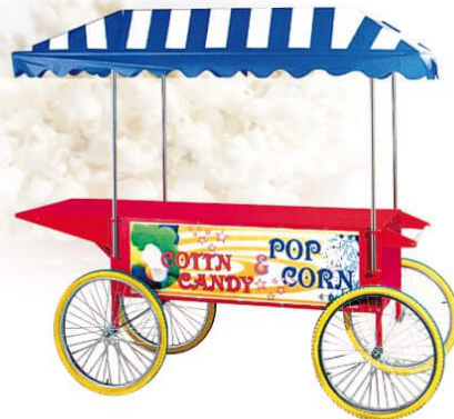
Popcorn Machine Cart

Model: HP-LC Dimension: 2070x760x2070mm Packing Size: 2080x660x680mm