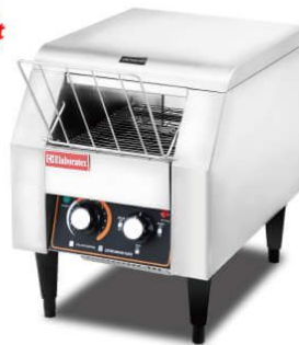
Electric Conveyor Toaster

Model: HET-150 Dimension: 290x420x380mm Volts: 220-240V/50-60Hz Power:1.34KW N/W: 14Kg