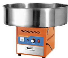
Electric Candy Floss Machine

Model: HEC-01 Dimension: 460x460x500mm Volts: 220-240V/50-60Hz Power: 0.9KW