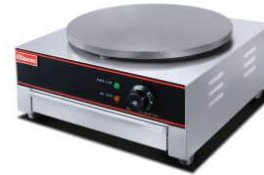
1-Plate Electric/Gas Crepe Maker

Model: HET-450 Dimension: 470x420x380mm Volts: 220-240V/50-60Hz Power:2.64KW N/W: 20.5Kg