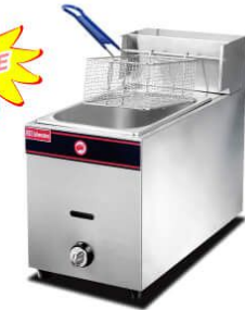
1-Tank 1-Basket Gas Fryer

Model: HGF-71 Dimension: 290x520x480mm Capacity: 6L Power: 18.9TU/hr N/W: 10.8Kg