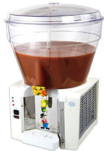
LSP50L Juice Dispenser