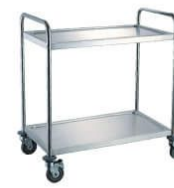
2 Tiers assembled dining cart