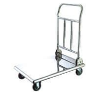
S/S luggage cart