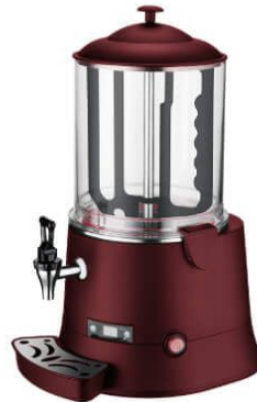
CH10L Hot Chocolate Machine