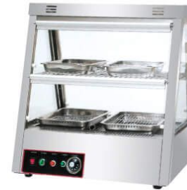
Food Display Warmer

Model: HEN-4HX Dimension: 430x690x950mm Volts: 220-240V/50-60Hz Power: 4KW N/W: 17Kg