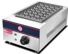
Electric 1-Head Fish Grill

Model: HX-34 Dimension: 270x470x260mm Volts: 220V/50Hz Power: 2KW N/W: 14Kg