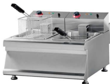
Counter Top 2-Tank 2-Basket Electric Fryer

Model: HEF-608 Dimension: 600x600x430mm Capacity: 8L+8L Volts: 220-240V/50-60Hz Hp: 3.25+3.25KW N/W: 25Kg