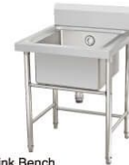
Single Sink Bench