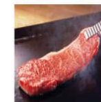
Counter Top Gas Lava Rock Grill

Model: HGL-607 Dimension: 650x612x530mm Hp: 57.6MJ Valve Type: Low-pressure Valve Butners: 2 N/W: 49Kg