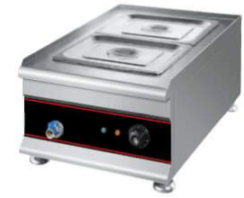
Electric Bain Marie

Model: HB-M2 Dimensions: 355x600x360mm Volts: 220-240V/50-60Hz Power: 1.2KW N/W: 12Kg