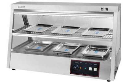
Food Display Warmer

Model: HW-2x3 Dimension: 1100x655x730mm Volts: 220-240V/50-60Hz Power: 1KW N/W: 35Kg Model: HW-2x4 Dimension: 1200x655x730mm Volts: 220-240V/50-60Hz Power: 1KW N/W: 43Kg