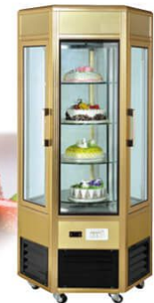
HCL-600L Cake Showcase