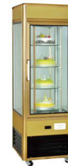
HCL-400L Cake Showcase