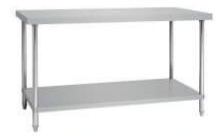
Work Table With Under Shelf