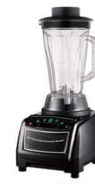
CB-999 Commercial Blender