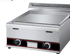
Gas Griddle (All Flat)

Model: HGG-753 Dimension: 760x650x550mm Gas: LPG or Natural Gas Power: 16KW/Hour N/W: 70Kg