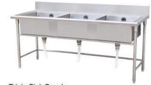
Triple Sink Bench