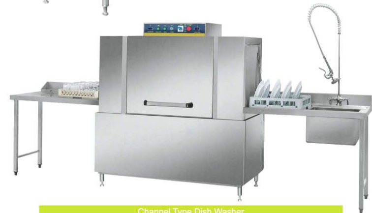
Channel Type Dish Washer

Model: HYT-C88 Dimension: 700x640x1430mm Volts: 380V /50Hz Total Power: 13KW Average Hourly Capacity: 60Basket/Hour High Temperature Tank Capacity: 7L Wash Tank Capacity: 30L High Temperature Tank Power: 9KW Wash Tank Power: 3KW