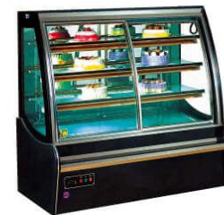
G680FS G800FS G1050FS Cake Showcase