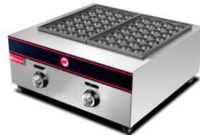
Gas 2-Head Fish Grill

Model: HX-56 Dimension: 470x470x260mm Volts: 220V/50Hz Power: 4KW N/W: 28Kg