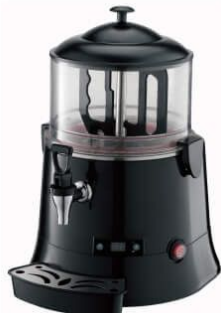
CH5L Hot Chocolate Machine