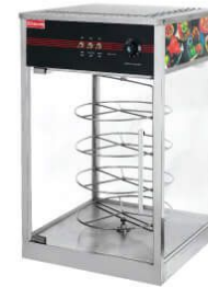
Pizza Display Warmer

Model: HW-580 Dimension: 640x360x530mm Volts: 220-240V/50-60Hz Power: 1.0KW Weight: 45Kg Model: HW-805 Dimension: 865x360x625mm Volts: 220V-240V/50-60Hz Power: 1.5KW Weight: 60Kg