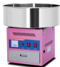
Electric Candy Floss Machine

Model: HEC-03 Dimension: 460x460x501mm Volts: 220-240V/50-60Hz Power: 0.9KW