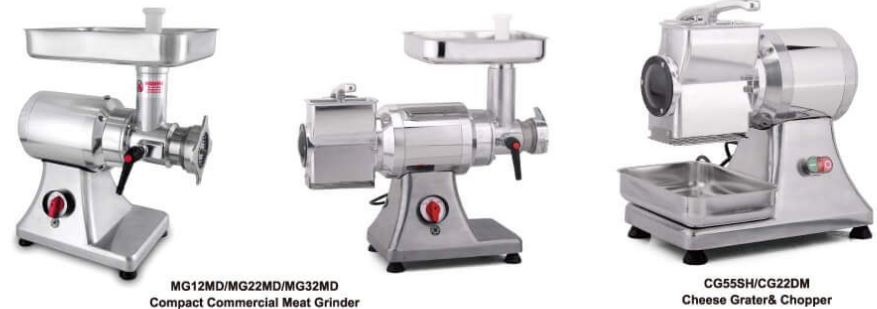
MG12MD/MG22MD/MG32MD Compact Commercial Meat Grinder