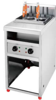
Electric Pasta Cooker

Model: HEN-6A Dimension: 590x550x280mm Volts: 220-240V/50-60Hz Power: 6KW N/W: 17Kg