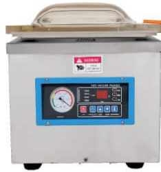
DZ260T DZ300T DZ400T