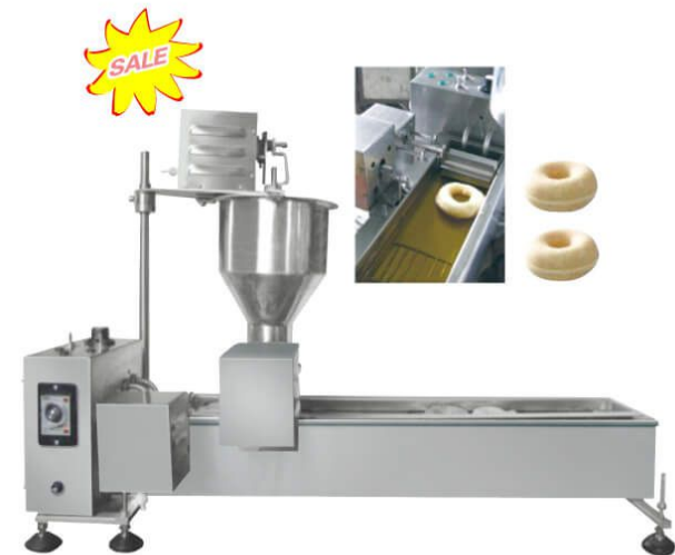
Auto Doughnut Fryer

Model: HDF-9T (One Shape Doughnut) Dimension: 980x550x330mm Volts: 220-240V/50-60Hz Power: 3KW N/W: 36Kg