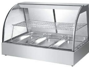
Curved Warming Showcase

Model: HW-838 Dimension: 730x770x730mm Volts: 220-240V/50-60Hz Power: 0.85KW