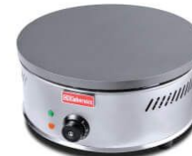
1-Plate Electric Crepe Maker

Model: HCM-2G Dimension: 860x470x230mm Gas: LPG Power: 8KW/Hour N/W: 44Kg