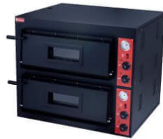
Electric/Gas Pizza Oven

Model: HEP-1ST Temperature: 0-350°C Pizza Stone Size: 400x400mmx1pcs Machine Size: 560x570x280mm Packing Size: 610x570x320mm Volts: 220-240V/50-60Hz Power: 2KW N/W: 24kg