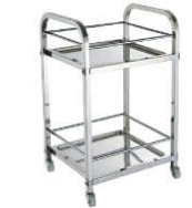
Assembled bar trolley