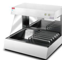
Counter Top French Fries Display Warmer

Model: HET-815 Dimension: 450x360x220mm Volts: 220V/50Hz Power: 2.5KW N/W: 19Kg