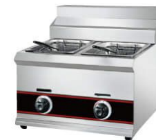
2-Tank 2-Basket Gas Fryer

Model: HEF-85 (2-Tank 2-Basket) Dimension: 590x500x960mm Capacity: 14L+14L Volts: 220V-240V/50-60Hz Power: 8KW N/W: 24Kg