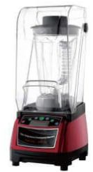
CB-999z Commercial Blender