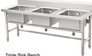
Triple Sink Bench