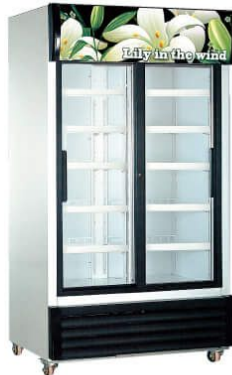
BC-800 BC-1200 Beverage Cooler