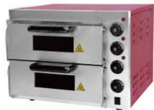
Electric Pizza Oven

Model: HGP-1 Dimension: 910x780x430mm Volts: 220V-50Hz Gas: LPG Power: 6KW/Hour+0.1KW Inner size: 600x600x150mm N/W: 48kg