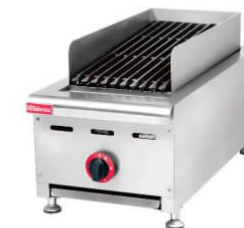
Gas Char Grill

Model: HEL-928 Dimension: 460x600x400mm Volts: 220V/50Hz Power: 5KW