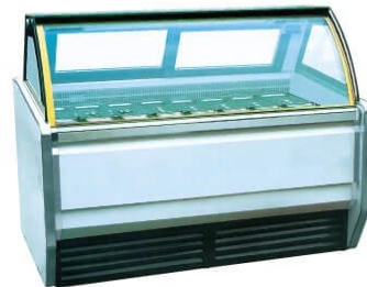
CD120BL CD150BL CD180BL Island Type Ice Cream Show Case