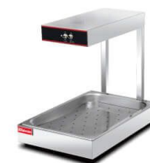
Portable Food Warmer

Model: HCW-620 Dimension: 795x445x210mm Volts: 220-240V/50-60Hz Power: 1KW N/W: 7Kg