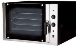
Electric Convection Oven

Model: HEO-07 Dimension: 680x650x620mm Volts: 220V/50Hz Power: 3.15KW N/W: 45Kg