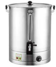
WB-8.8B/15B/20B/30B/40B Single-Layer Water Boiler(Heat)