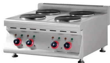
Counter Top 4-Burner Electric Cooker

Model: HRQ-605E Dimension: 600x600x350mm Volts: 220-240V/50-60Hz Hp: 8.2KW N/W: 20Kg