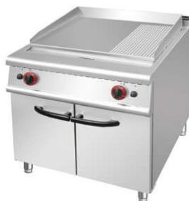
Gas Griddle (2/3 Flat&1/3 Grooved) with Cabinet

A Model: HGR-906 Dimension: 800x900x920mm Packing Size: 880x980x1040mm Power: 40389BTU/Hour N/W: 125Kg A Model: HGR-706 Dimension: 700x750x920mm Packing Size: 780x830x1040mm Power: 40389BTU/Hour N/W: 95Kg