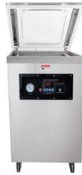
DZ400S DZ500S DZ600S