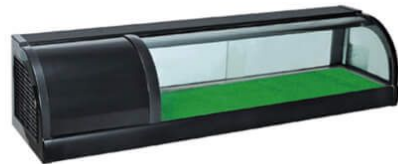
Sushi Display Cooler