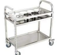
Assembled seasoning cart