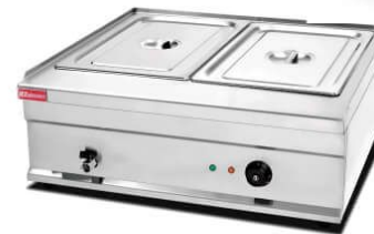
Electric Bain Marie

Model: HB-904 Dimension: 715x560x380mm Volts: 220-240V/50-60Hz Power: 1.6KW N/W: 27Kg