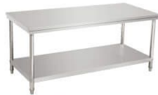
Work Table With Under Shelf