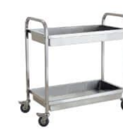
2 Tiers collected trolley