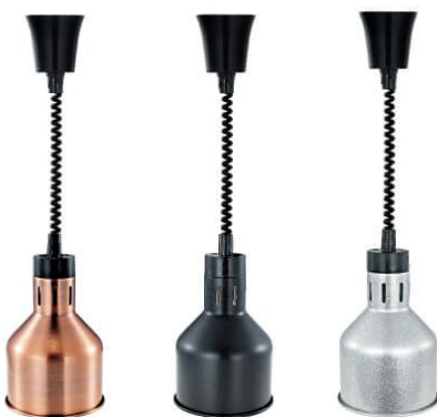
Bronze Black Silver

Model: A031 Power: 220V/250W Diameter: 175mm Adjustable Height: 0.6~1.8m