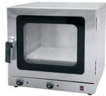
Electric Convection Oven

Model: HEB-8F Dimension: 835x770x580mm Volts: 220V/50Hz Power: 6.4KW N/W: 56Kg