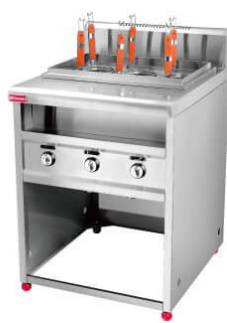
Gas Pasta Cooker

Model: HEN-4HX Dimension: 430x690x950mm Gas: LPG or Natural Gas Power: 56500BTU/Hour N/W: 20Kg