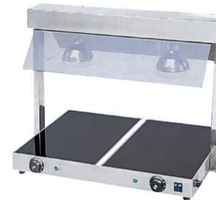
Electric Warming Tray

Model: HW-848 Dimension: 900x520x700mm Volts: 220-240V/50-60Hz Power: 0.2KW