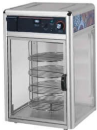
Pizza Warming Showcase

Model: HW-13 Dimension: 500x450x770mm Volts: 220V-240V/50-60Hz Power: 0.85KW Weight: 26Kg