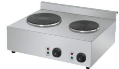
Double Induction Cooker

Model: HSC-2203 Dimension: 520x360x250mm Volts: 220-240V/50-60Hz Power: 2.6KW N/W: 6.5Kg