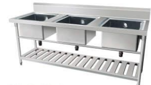
Triple Sink Bench