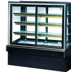
G630FSH G820FSH G1000FSH Cake Showcase