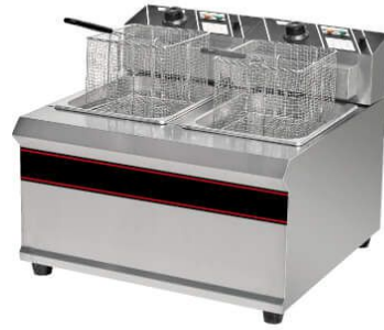
2-Tank 2-Basket Electric Fryer

Model: HEF-902 Dimension: 600x600x450mm Packing Size: 660x600x545mm Capacity: 16L Volts: 220V-240V/50-60Hz Power: 2.8+2.8KW N/W: 18Kg