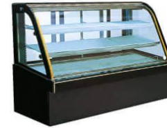
TB368A TB468A TB568A Cake Showcase