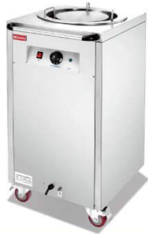
1- Head Electric Plate Warmer Cart

Model: HPW-1 Dimension: 450x570x900mm Volts: 220-240V/50-60Hz Power: 0.4KW