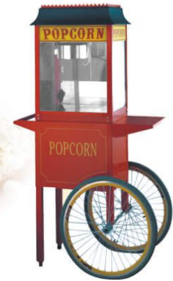
Popcorn Machine with Cart

Model: HP-800C Dimension: 800x470x1540mm Volts: 220-240V/50-60Hz Power: 1.44KW