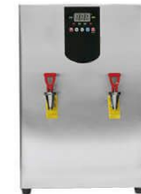
HB-30LA/40L/60L Microcomputer Water Boiler