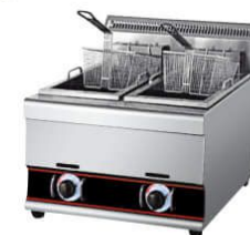
2-Tank 2-Basket Gas Fryer

Model: HGF-772 Dimension: 600x650x550mm Capacity: 12.5L+12.5L Power: 9KW/Hour N/W: 40Kg