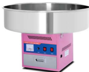
Electric Candy Floss Machine

Model: HEC-03 Dimension: 460x460x501mm Volts: 220-240V/50-60Hz Power: 0.9KW