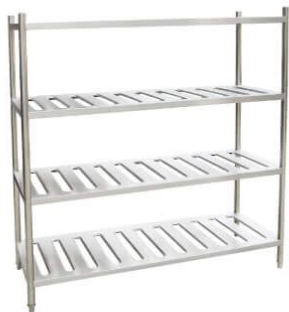
Food Storage Rack