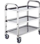
3 Tiers assembled dining cart