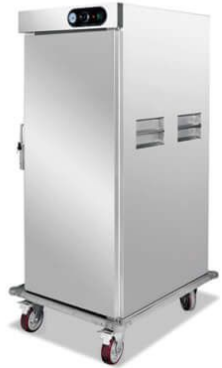
Food Warmer Cart