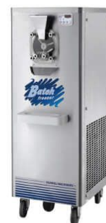
Hard Ice Cream Machine

Model: HIM-08 Machine: 570x780x1500mm Packing: 630x835x1650mm Volts: 220-240V/50-60Hz Power: 4.2KW Output: 60-75L/Hour Refrigerant: R22/R404A N/W: 190Kg