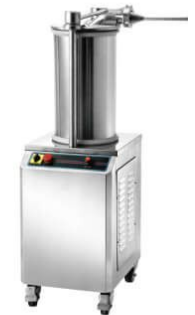
SF-150/260/350 Rapid Sausage Filler