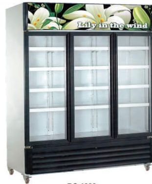
BC-1380 Beverage Cooler