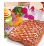
Counter Top Gas Griddle

Model: HGR-606 Dimension: 600x612x530mm Hp: 28.8MJ Valve Type: Low-pressure Valve Butners: 2 N/W: 46Kg