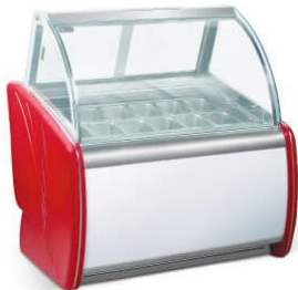
BQG-1200 BQG-1500 BQG-1800 Ice Cream Show Case