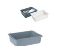
Plastic Tote Box