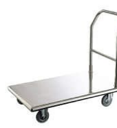
Assembled luggage cart