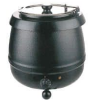
Electric Soup Kettle

Model: 83013SP Dimension: 13L Volts: 220V AC/50Hz Power: 600W