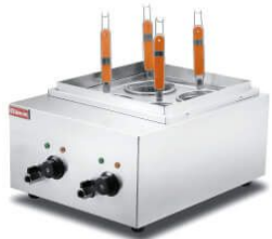
Counter Top Electric Pasta Cooker

Model: HEN-4A Dimension: 410x570x280mm Volts: 220-240V/50-60Hz Power: 4KW N/W: 13Kg