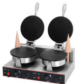
2-Plate Cone Baker

Model: HCB-1 Dimension: 282x380x230mm Volts: 220-240V/50-60Hz Power: 1KW N/W: 6.4Kg