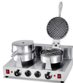
2-Plate Waffle Baker

Model: HWB-1 Dimension: 250x350x260mm Volts: 220-240V/50-60Hz Power: 1KW N/W: 5.4Kg