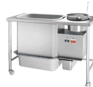
Electric Breeding Table

Model: HBT-1000 Dimension: 1000x700x800(950)mm