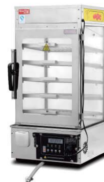
Food Display Warmer (Touch Screen)

Model: HW-60-1 Dimension: 660x480x610mm Volts: 220~240V/50~60Hz Power: 1.84KW N/W: 33Kg