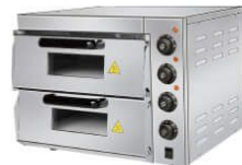
Electric Pizza Oven

Model: HEP-01-1 Temperature: 0-350°C Pizza Stone Size: 638x430mmx1pcs Machine Size: 870x600x345mm Volts: 220-240V/380V Power: 4.2KW