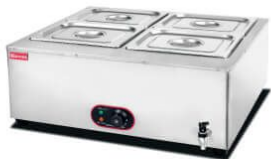
Electric Bain Marie

Model: HB-750 Dimension: 750x750x280mm Volts: 220-240V/50-60Hz Power: 3KW N/W: 18Kg