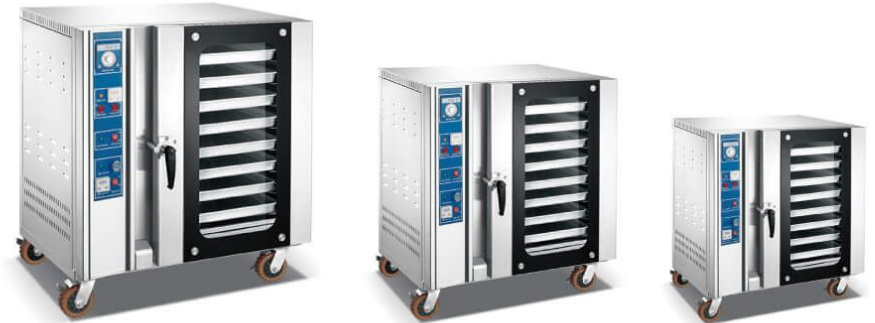
Electric Convection Oven

Model: FJ-32 Dimension: 1000x690x1880mm Volts: 220V/50Hz Power: 2.8KW Capacity: 32 Pans Production: 120Kg/Hour