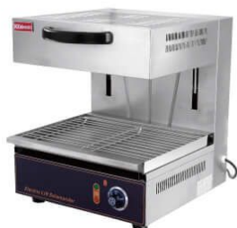
Electric Lift Salamander

Model: HES-450 Dimension: 450x510x530mm Volts: 220V-240V/50-60Hz Power: 2.8KW N/W: 36Kg