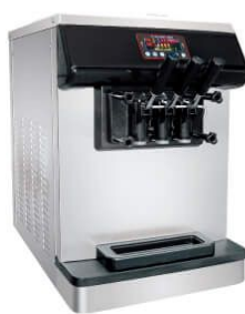
Ice Cream Machine

Model: HIM-03 Dimension: 900x700x840mm Volts: 220-240V/50-60Hz Power: 1.7KW Output: 11-16Kg/Hour(18-25L) Refrigerant: R22/R404A N/W: 108Kg