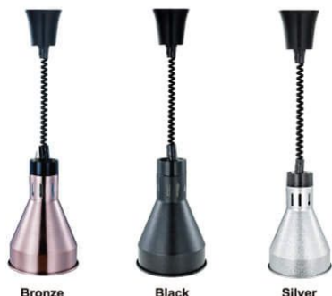
Bronze Black Silver