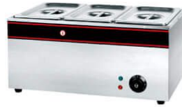
Electric Bain Marie

Model: HB-4V Dimension: 700x600x280mm Volts: 220-240V/50-60Hz Power: 1.5KW N/W: 16.5Kg