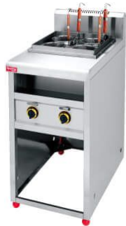
Gas Pasta Cooker

Model: HEN-4HX Dimension: 430x690x950mm Gas: LPG or Natural Gas Power: 56500BTU/Hour N/W: 20Kg