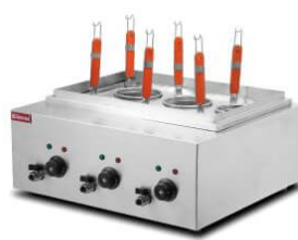
Counter Top Electric Pasta Cooker

Model: HEN-4A Dimension: 410x570x280mm Volts: 220-240V/50-60Hz Power: 4KW N/W: 13Kg