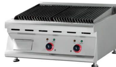
Counter Top Electric Lava Rock Grill

Model: HEL-607 Dimension: 650x600x350mm Volts: 220-240V/50-60Hz Hp: 7.2KW N/W: 43Kg