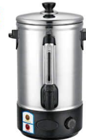
WB-10/15/25/30/35/40 Double-Layer Water Boiler(Heat & Warm)