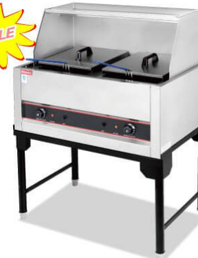
2-Tank 2-Basket Electric Fryer

Model: HEF-912 Dimension: 840x510x810mm Capacity: 21+21L Volts: 220V-240V Power: 4.5+4.5KW N/W: 34Kg