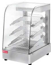
Food Display Warmer

Model: HW-861 Dimension: 350x455x580mm Volts: 220~240V/50~60Hz Power: 1.3KW N/W: 21Kg