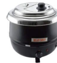
Electric Soup Kettle

Model: 81010SP Dimension: 10L Volts: 220V AC 50Hz Power: 400W