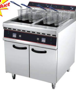
2-Tank 4-Basket Electric Fryer

Model: HEF-26-2 Dimension: 800x830x1080mm Capacity: 30L+30L Volts: 380V Power: 20KW N/W: 58Kg