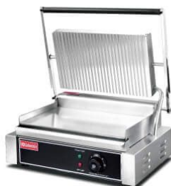
Electric Contact Grill

Model: HEG-813 Dimension: 580x400x210mm Volts: 220V/50Hz Power: 1.8+1.8KW N/W: 26Kg