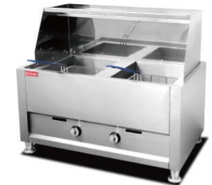
2-Tank 2-Basket Gas/Electric Fryer

Model: HGF-907C Dimension: 850x515x620mm Capacity: 21L+21L Gas: LPG N/W: 32Kg