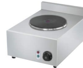
Single Induction Cooker

Model: HX-34R Dimension: 270x470x260mm Gas: LPG Heating: 12053BTU/Hour N/W: 14Kg