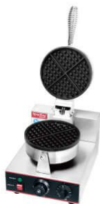
1-Plate Waffle Baker

Model: HWB-1 Dimension: 250x350x260mm Volts: 220-240V/50-60Hz Power: 1KW N/W: 5.4Kg