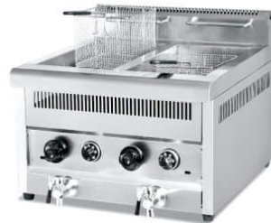
2-Tank 2-Basket Gas Fryer

Model: HGF-72A Dimension: 615x610x430mm Capacity: 16L Power: 6KW / 20470BTU N/W: 27Kg