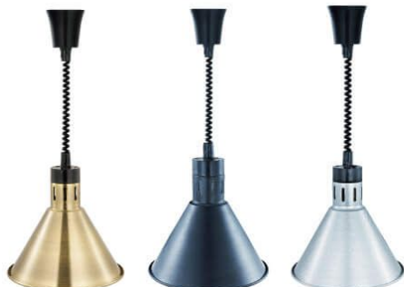
Bronze Black Silver

Model: A032 Power: 220V/250W Diameter: 175mm Adjustable Height: 0.6~1.8m