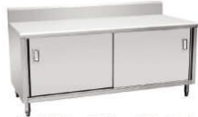
Economical Kitchen Cabinet With Backsplash