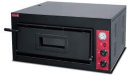
Electric/Gas Pizza Oven

Model: HEP-1 Dimension: 890x790x430mm Volts: 3N-380V Power: 4.2KW N/W: 48kg