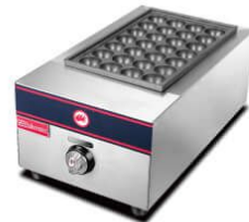
Gas 1-Head Fish Grill

Model: HX-34 Dimension: 270x470x260mm Volts: 220V/50Hz Power: 2KW N/W: 14Kg