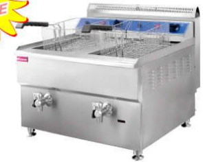
2-Tank 2-Basket Gas/Electric Fryer

Model: HGF-780 Dimension: 680x615x630mm Capacity: 18L+18L Gas: LPG Power: 10KW/Hr N/W: 38Kg