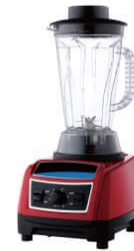
CB-968 Commercial Blender