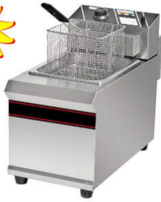
1-Tank 1-Basket Electric Fryer

Model: HEF-901 Dimension: 300x600x450mm Packing Size: 520x500x420mm Capacity: 8L Volts: 220V-240V/50-60Hz Power: 2.8KW N/W: 10Kg