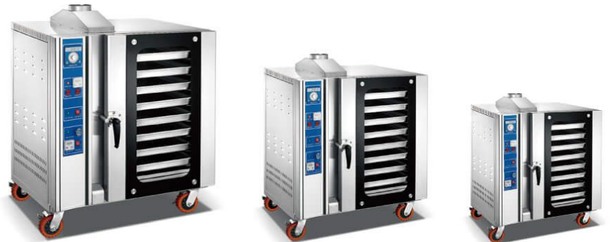
Gas Convection Oven