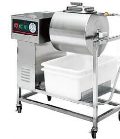
Vacuum Meat Salting Machine

Model: HML-900 Dimension: 910x480x1030mm Volts: 220-240V/50-60Hz Power: 0.38KW N/W: 59Kg