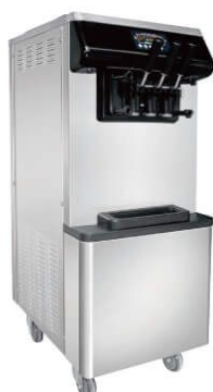
Ice Cream Machine

Model: HIM-02 Dimension: 700x900x1435mm Volts: 220-240V/50-60Hz Power: 1.7KW Output: 11-16Kg/Hour(18-25L) Refrigerant: R22/R404A N/W: 135Kg