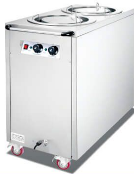
2- Head Electric Plate Warmer Cart

Model: HPW-1 Dimension: 450x570x900mm Volts: 220-240V/50-60Hz Power: 0.4KW