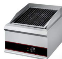
Electric Lava Rock Grill

Model: HGS-14 Dimension: 610x460x610mm Power: 24TU/hr N/W: 31.6Kg