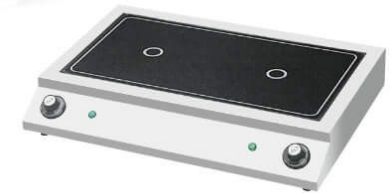
2-Head Induction Oven

Model: HP-2000 Dimension: 350x420x100mm Volts: 220V/50Hz Power: 2KW N/W: 5Kg