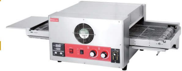
Electric Conveyor Pizza Oven

Model: HGP-18 Dimension: 1560x750x430mm 15KW/Hour + 0.1KW Work Station Dimension: 500x1450mm N/W: 96Kg