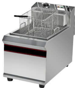
1-Tank 1-Basket Electric Fryer

Model: HEF-780 Dimension: 680x615x630mm Capacity: 18L+18L Volts: 220V-240V/50-60Hz Power: 4.5KW+4.5KW N/W: 38Kg