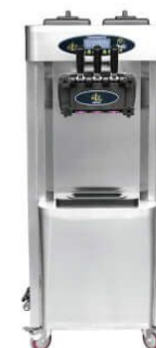
Soft Ice Cream Machine

Model: IIM18 Dimension: 900x700x1435mm Volts: 220-240V Power: 1.7KW Output: 28-38L Refrigerant: R22 N/W: 138Kg Model: IIM-28 Dimension: 900x700x1435mm Volts: 380V Power: 3.4KW Output: 43-52L Refrigerant: R404A N/W: 168Kg