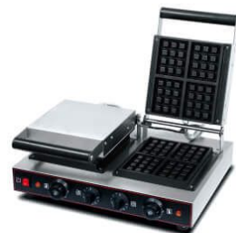
2-Plate Waffle Baker

Model: HWB-1S Dimension: 282x380x230mm Volts: 220-240V/50-60Hz Power: 1.6KW N/W: 11.6Kg