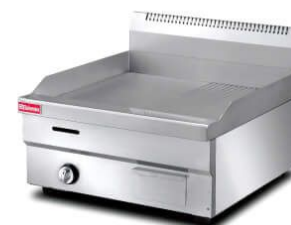
Gas Griddle (1/3 Grooved)

Model: HGG-530-2 Dimension: 530x600x475mm Gas: LPG or Natural Gas Power: 10.7KW