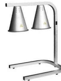
Infrared Warm lamp

Model: HW-819A (1-Lamp) Dimension: 580x430x330mm Volts: 220-240V/50-60Hz Power: 0.25KW