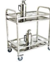
16-Case water-jug cart