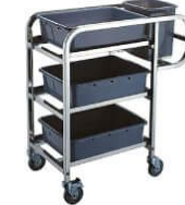
3 Tiers collected trolley