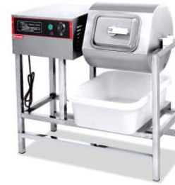
Meat Salting Machine

Model: HC-02 Dimension: 430x220x330mm N/W: 5Kg