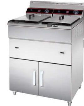
2-Tank 2-Basket Gas Fryer

Model: HGF-182C Dimension: 690x585x1025mm Capacity: 18x2L Gas: LPG or Natural Gas N/W: 50Kg