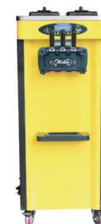
Soft Ice Cream Machine

Model: HIM-25DB Dimension: 715x560x1380mm Packing Size: 780x620x1480mm Volts: 220V/50Hz Hp: 1.8KW Out Put: 25L/H Refrigerant: R22/R404A Compressor: Panasonic Or Aspera