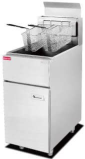
1-Tank 2-Basket Gas Fryer

Model: HGF-778 Dimension: 400x700x1100mm Capacity: 25L Gas: LPG or Natural Gas Power: 12KW/Hr N/W: 41Kg