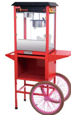
Popcorn Machine with Cart

Model: HP-LC Dimension: 2070x760x2070mm Packing Size: 2080x660x680mm