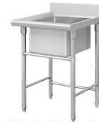
Economical Single Sink Bench