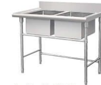
Economical Double Sink Bench