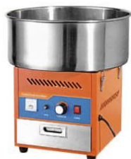
Electric Candy Floss Machine

Pink color and orange color are available. Adjustable temperature control. All Candy Floss Machines come with a dedicated sugar spoon. Over-temperature protection device.