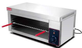
Electric Hanging Salamander

Model: HES-936 Dimension: 610x310x280mm Volts: 220V-240V/50-60Hz Power: 2KW N/W: 10.8kg