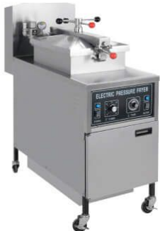
Electric Pressure Fryer

Model: MDXZ-24 Dimensions: 460x960x1230mm Packing Size: 1030x510x1300mm Capacity: 24L Volts: 3N~380V/50Hz Power: 14.2KW N/W: 110Kg For 4-6 Chickens