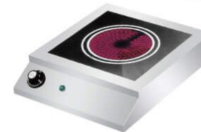
1-Head Induction Oven

Model: HX-65R Dimension: 740x470x260mm Gas: LPG Heating: 36160BTU/Hour N/W: 42Kg