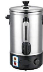
WB-20A/30A/40A/55A Single-Layer Water Boiler(Heat)