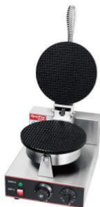
1-Plate Cone Baker

Model: HWB-2 Dimension: 500x350x260mm Volts: 220-240V/50-60Hz Power: 2KW N/W: 10.4Kg