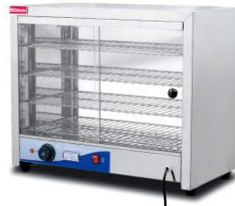
Food Display Warmer

Model: HW-14 Dimension: 550x450x770mm Volts: 220V-240V/50-60Hz Power: 0.85KW Weight: 38Kg