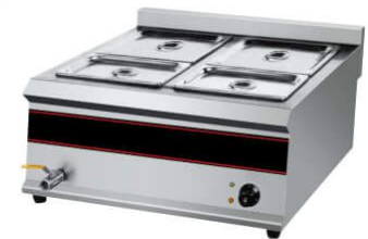
Electric Bain Marie

Model: HB-906 Dimension: 615x560x380mm Volts: 220-240V/50-60Hz Power: 1.6KW N/W: 25Kg