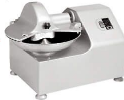
Food Cut Up Machine

Model: TQ-5/TQ-5A (Painting/ SS body) Size: 530x420x540mm Volts: 220V/50Hz Power: 0.37KW Productivity: 80Kg/Hour Weight: 62Kg