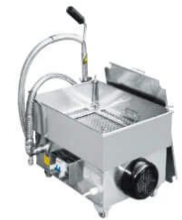
Shortening Filter Cart

Model: HBT-1200 Dimensions: 1200x750x1100mm Volts: 220-240V/50Hz Power: 0.18KW N/W: 60Kg