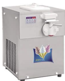
Ice Cream Machine

Model: HIM-01 Dimension: 570x740x750mm Volts: 220-240V/50-60Hz Power: 0.9KW Output: 8-11Kg/Hour(13-18L) Refrigerant: R22/R404A N/W: 59Kg