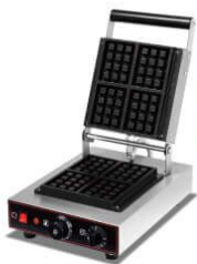
1-Plate Waffle Baker

Model: HCB-2 Dimension: 570x380x230mm Volts: 220-240V/50-60Hz Power: 2KW N/W: 12.4Kg