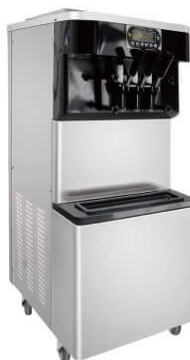
Ice Cream Machine

Model: HIM-04 Machine: 570x780x1400mm Packing: 630x835x1540mm Volts: 220-240V/50-60Hz Power: 2.2KW Output: 28-38L/Hour Refrigerant: R22/R404A N/W: 138Kg