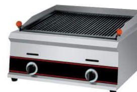
Gas Lava Rock Grill

Model: HGS-16 Dimension: 860x460x610mm Power: 42TU/hr N/W: 47.2Kg