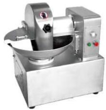
Food Cut Up Machine

Model: TQ-5/TQ-5A (Painting/ SS body) Size: 530x420x540mm Volts: 220V/50Hz Power: 0.37KW Productivity: 80Kg/Hour Weight: 62Kg