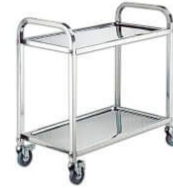
2 Tiers assembled dining cart