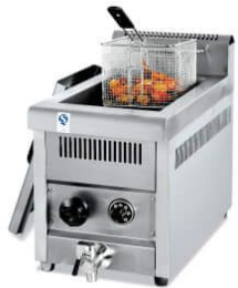
1-Tank 1-Basket Gas Fryer

Model: HGF-71A Dimension: 300x580x430mm Capacity: 8L Power: 3KW/11000BTU Weight: 11Kg