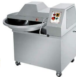
Food Cut Up Machine

Model: QS-620/QS-620A (Painting/ SS body) Size: 775x710x940mm Volts: 220V/50Hz Power: 1.1KW Capacity: 20L Productivity: 120Kg/Hour Weight: 126Kg