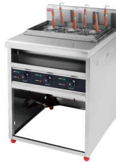
Electric Pasta Cooker

Model: HGN-6HX Dimension: 600x690x950mm Gas: LPG or Natural Gas Power: 84750BTU/Hour N/W: 31Kg