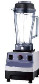
CB-768A Commercial Blender