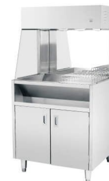
Pedestal Fries Display Warmer

Model: HCS-02-B Dimension: 1500x760x790mm Volts: 220-240V/50-60Hz Power: 0.65KW N/W: 57.3Kg