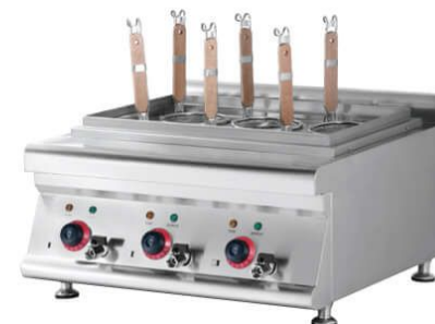
Counter Top Electric Pasta Cooker

Model: HEN-610 Dimension: 600x600x350mm Volts: 220-240V Power: 6KW Weight: 22.6Kg