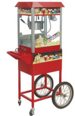
Popcorn Machine with Cart

Model: HP-CC Dimension: 940x450x1540mm Volts: 220-240V/50-60Hz Power: 1.44KW