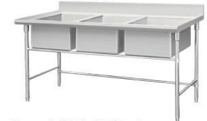
Economical Triple Sink Bench