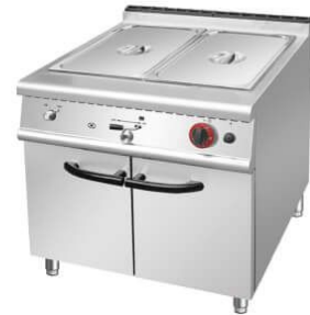
Gas Bain Marie with Cabinet

A Model: HGR-909 Dimension: 800x900x920mm Packing Size: 880x980x1040mm Power: 54765BTU/Hour N/W: 90Kg A Model: HGR-709 Dimension: 700x750x910mm Packing Size: 780x830x1040mm Power: 54650BTU/Hour N/W: 87Kg