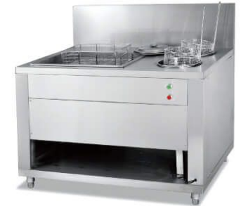
Electric Breeding Table

Model: HML-809 Dimension: 953x660x914mm Volts: 220-240V/50-60Hz Power: 0.3KW N/W: 75Kg