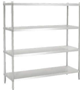
Food Storage Rack