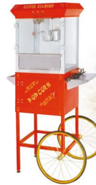
Popcorn Machine with Cart

Model: HP-6E Dimension: 600x460x770mm Volts: 220-240V/50-60Hz Power: 1.4KW