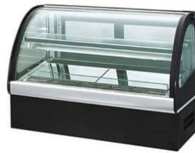
Curved Cooling Showcase

Model: HW-838-3 Dimension: 1140x690x710mm Volts: 220-240V/50-60Hz Power: 1.2KW