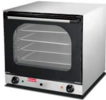
Electric Convection Oven

Model: HEB-4F Dimension: 595x600x580mm Volts: 220V/50Hz Power: 2.6KW N/W: 39Kg