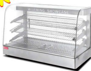
Food Display Warmer

Model: HW-862 Dimension: 650x455x580mm Volts: 220~240V/50~60Hz Power: 1.3KW N/W: 33Kg