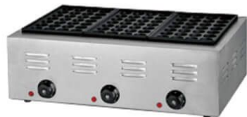
Electric 3-Head Fish Grill

Model: HX-56R Dimension: 470x470x260mm Gas: LPG Heating: 26700BTU/Hour N/W: 28Kg