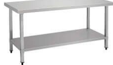
Work Table With Under Shelf (Square Leg)