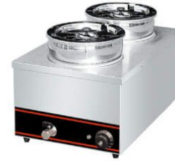
Table Top Bain Marie

Model: HB-3V Dimension: 580x450x240mm Volts: 220-240V/50-60Hz Power: 1.5KW N/W: 10Kg