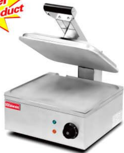
9-Slice Toaster(San Blast Finish)

Model: HT-01 Dimension: 540x400x290mm Volts: 220-240V/50-60Hz Power: 2.2KW N/W: 12Kg