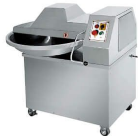
Food Cut Up Machine

Model: QS630 (SS body) Size: 990x810x980mm Volts: 220V/50Hz Knife motor power: 2.2/2.8kw Bowl motor power: 1.1kw Capacity: 25L Productivity: 300kg/Hour Weight: 318kg