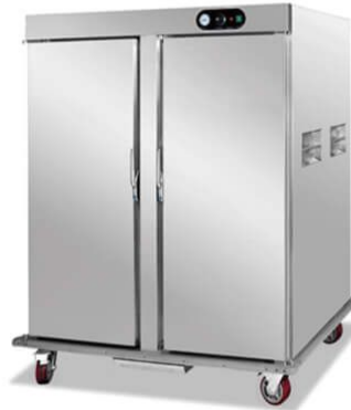
Food Warmer Cart