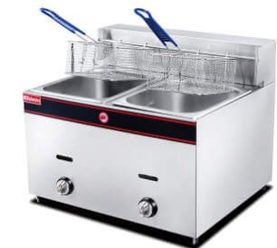
2-Tank 2-Basket Gas Fryer

Model: HGF-72 (2-Tank 2-Basket) Dimension: 570x520x480mm Capacity: 6L+6L Power: 37.8Tu/hr N/W: 18.4Kg