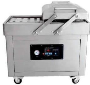
DZ400/2C DZ500/2C DZ600/2C