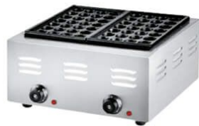
Electric 2-Head Fish Grill

Model: HSC-2205 Dimension: 610x520x250mm Volts: 220-240V/50-60Hz Power: 2+2.6KW N/W: 10Kg