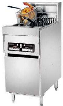
1-Tank 2-Basket Computer Fryer

Model: HEF-871 Dimension: 400x800x1125mm Capacity: 28L Volts: 3N~380V Hp: 18KW N/W: 40Kg