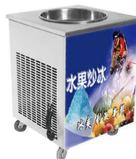
Fried Ice Cream Machine

Model: HIM-05 Machine: 540x780x1400mm Packing: 630x835x1540mm Volts: 220-240V/50-60Hz Power: 2.5KW Output: 28-38L/Hour Refrigerant: R22/R404A N/W: 162Kg