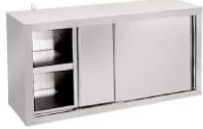
Hang A Wall To Condole Ark